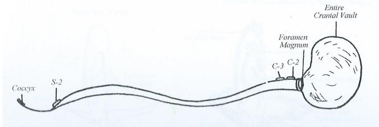
Figure 1a: Dural Attachments to Bone/Skull

attachments on the posterior bodies of C1 and C2. It continues in the inferior direction without any attachments until it anchors at the S2 segment as the pia portion of the filum terminale within the sacral canal. It exits out of the sacral canal and continues as the external dural segment of the filum terminale blending with the periosteum of the coccyx. (Figures 1a,b,c) In addition, the dura mater extends out through the intervertebral foramina with the spinal nerves as the dural sleeves. The dural sleeves attach on the vertebral bodies blending with the paravertebral fascial tissue. These anatomical attachments help give credence to the continuity of the fascia and why CST has such far reaching affects.